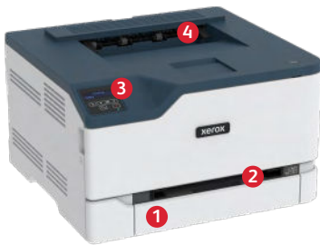
Xerox C230 Color Printer