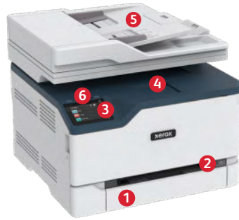
Xerox C235 Color Multifunction Printer